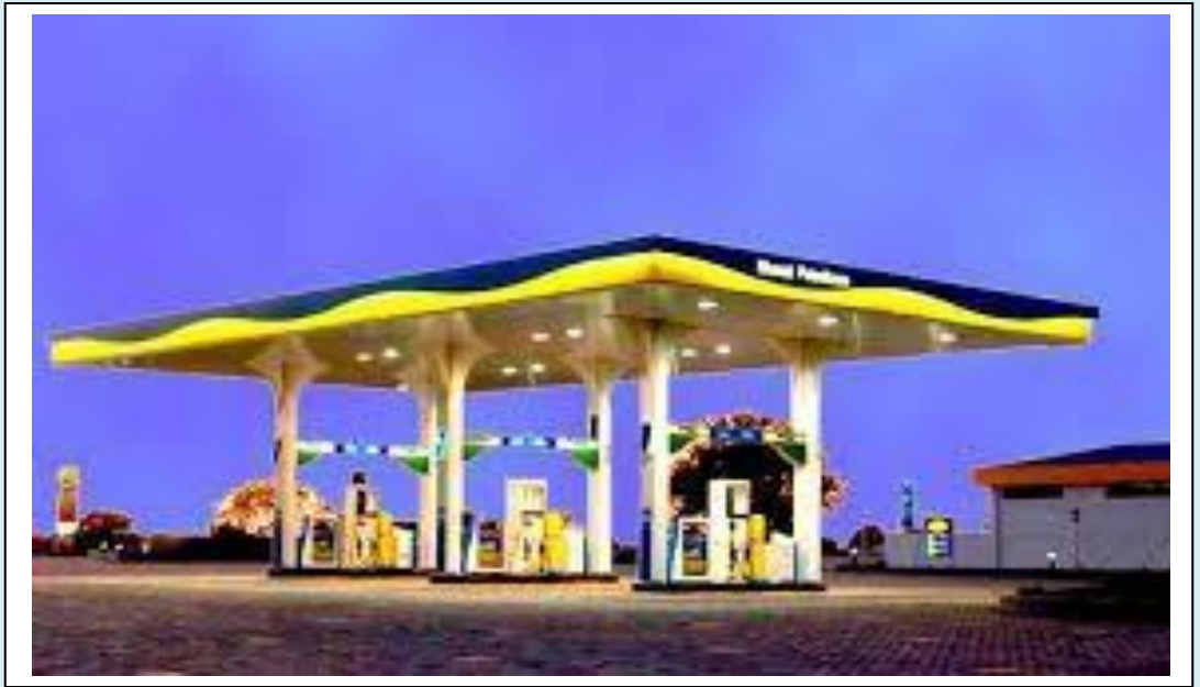
NEW RETAIL OUTLET – BHAGBAN DAS PETROLEUM, BINAGANJ, MP