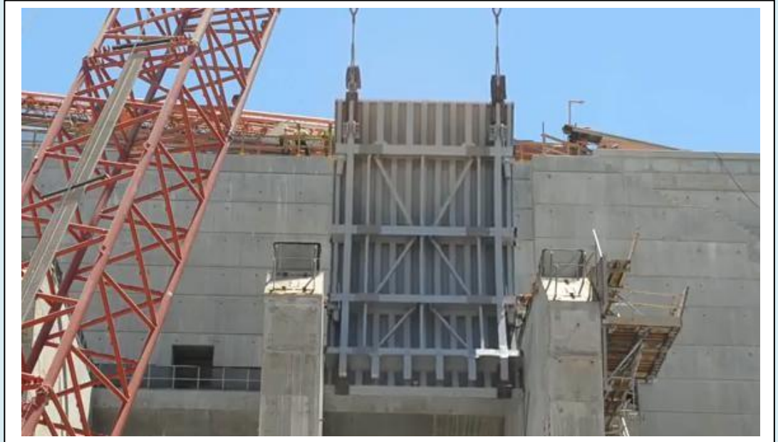
DAM PROJECTS – MOHAPURA AND KUNDALIA, PENCH & TAPOVAN H.E. PROJ.