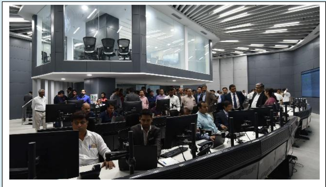
SMART CONTROL ROOM - BHOPAL SMART CITY, BHOPAL, MP