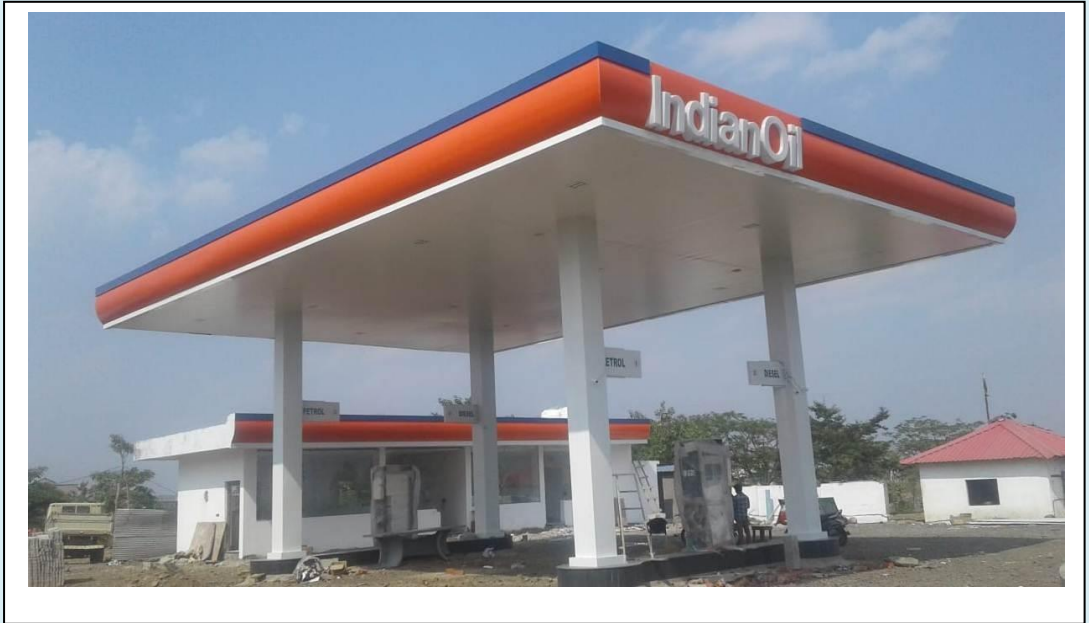
NEW RETAIL OUTLET - SIKARWAR PETROL PUMP, RATIBAD-NILBAD, BHOPAL