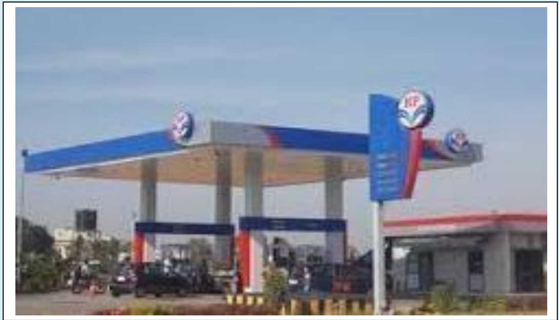
NEW RETAIL OUTLET – HAMARA PUMP, KUSHALGARH, BANSHBADA, RJ