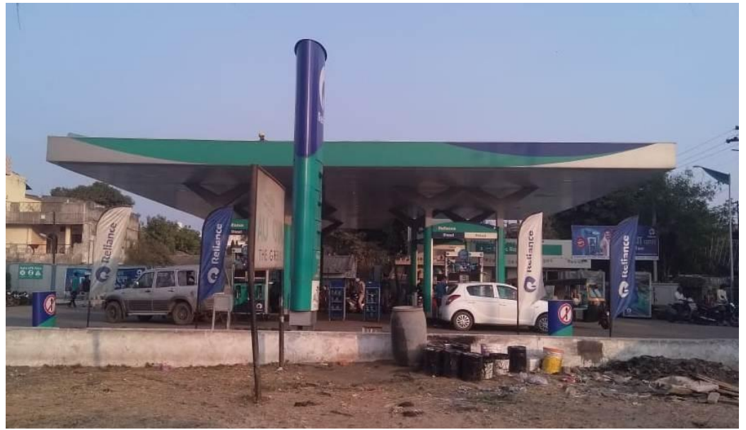
NEW RETAIL OUTLET – MPC-025, KAZI KAMP, BERASIA ROAD, BHOPAL